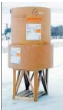
This frame holds 1250 kg paperrolls