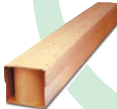
and/or other Eltete products