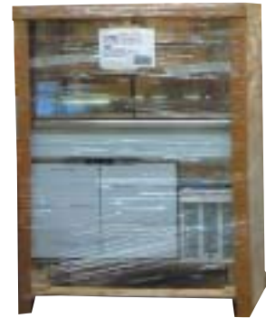
New Packaging 100 % recyclable carton