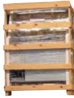
Old packaging Wood

With this type of packaging Eltete clients have received several benefits including cost savings of up to 30 %.