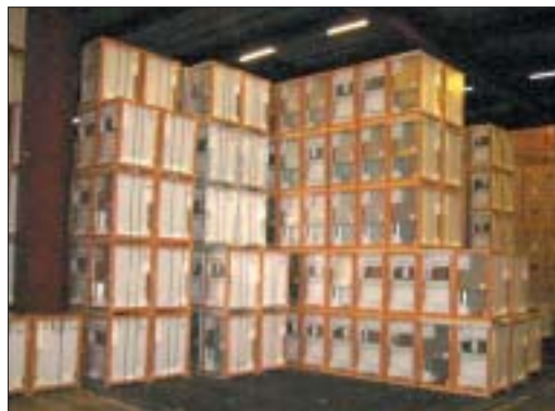
Electrolux is stacking 5 to 6 ovens on top of each other in stock